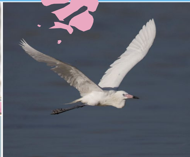
Reddish Egret 📷 1, 9, 12