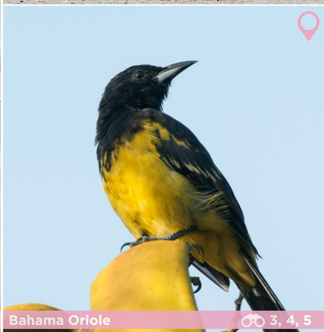
Bahama Oriole 📷 3, 4, 5