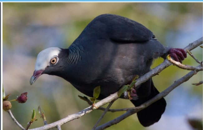
White-crowned Pigeon 📷 8