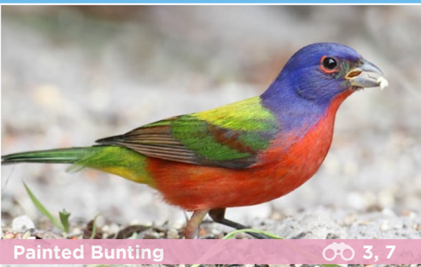
Painted Bunting 📷 3, 7