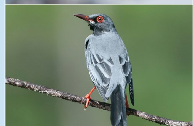
Red Legged Thrush 📷 6, 7, 8