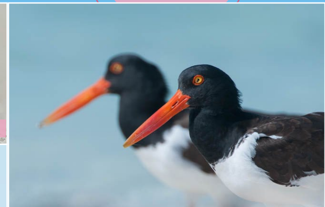
American Oystercatcher 📷 1