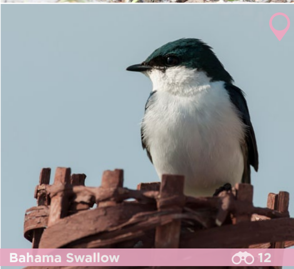
Bahama Swallow 📷 12