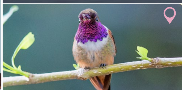
Bahama Woodstar 📷 3, 4, 5, 6, 8, 10, 11