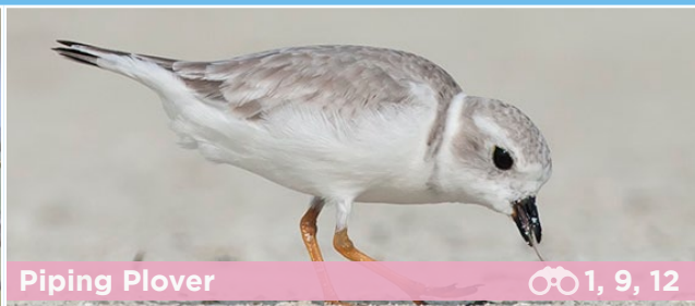
Piping Plover 📷 1, 9, 12