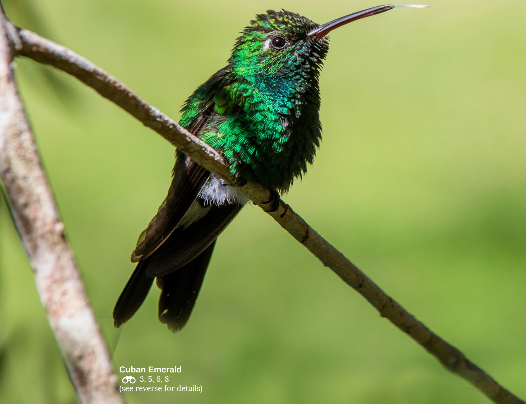
Cuban Emerald 👁️ 3, 5, 6, 8 (see reverse for details)

You've heard of our white sand beaches. Our turquoise ocean waters. But what about our spectacular birds found nowhere else in the world? The Bahamas is a sublime spot for birdwatching the whole family will love.